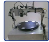
Automation Test Machine