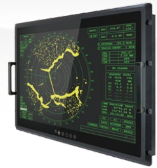
Option 2 With Projected Capacitive Multi Touch