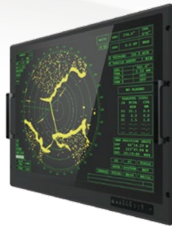
Option 1 With AR Protection Glass, No Touch function