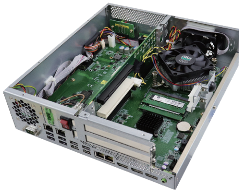
MB211 Digital IO