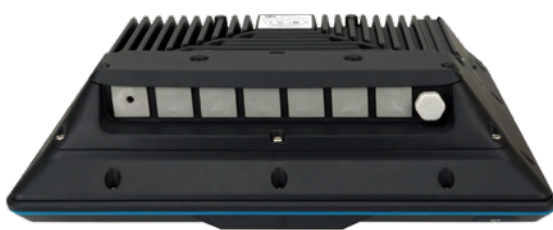
Standard IO cover