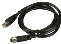
RJ-45 LAN cable (CB-M12RJ45-R10)