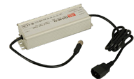
Water-proof Power Adapter (63040-030080-000-RS)