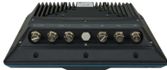
M12 IO cover