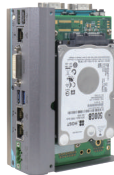
▲ POC-300 with MeziO™ - R11 and 2.5" HDD

** For sub-zero operating temperature, a wide temperature HDD drive or Solid State Disk (SSD) is required.