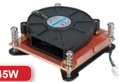
45W CF-115XA-R10 1U chassis compatible