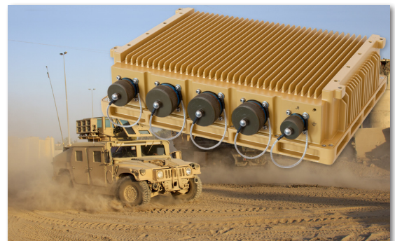
MIL-MAXBES for use in Military Environments