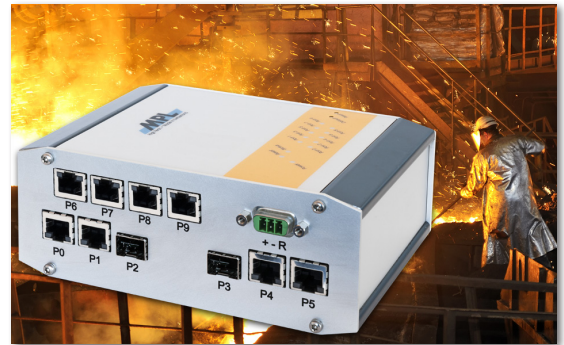
MAXBES for the harsh Industrial Environment

* Typically 10 years or more, 20+ years repair-ability