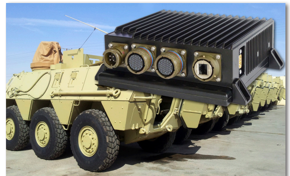
MAGBES built in MIL housing for Military Environments