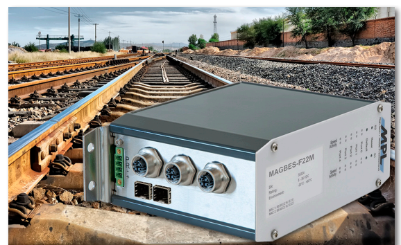
Boxed MPL Switch with 5 x M12 Gigbit ports