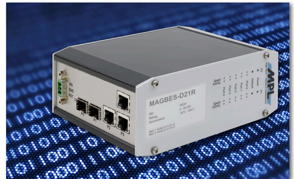
Boxed MPL Switch with 5 ports (3 x RJ45 & 2 x SFP)

* Typically 10 years or more, 20+ years repair-ability