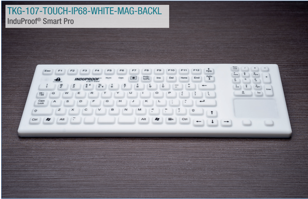
TKG-107-TOUCH-IP68-WHITE-MAG-BACKL InduProof® Smart Pro