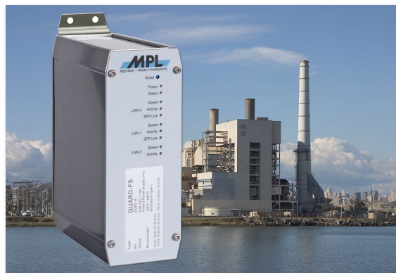
Firewall/Router used in sensitive environment

* Typically 10 years or more, 20+ years repair-ability