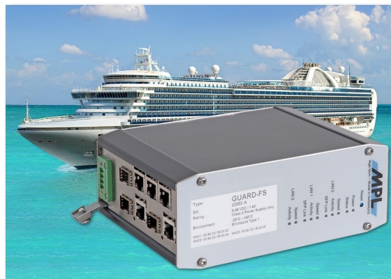
GUARD used as frontend in maintenance monitoring system