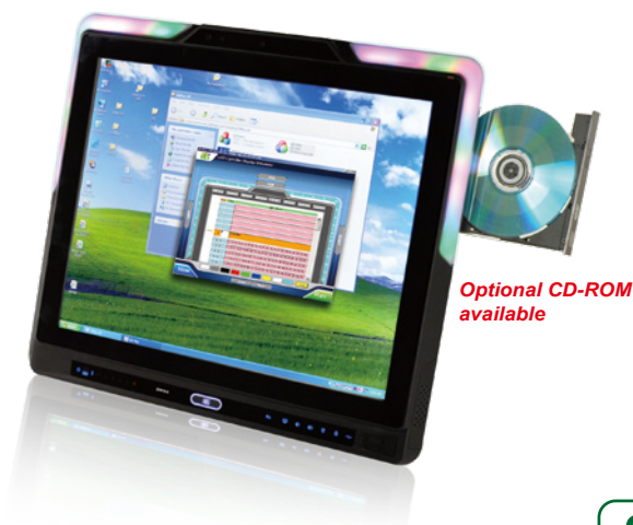
Optional CD-ROM available