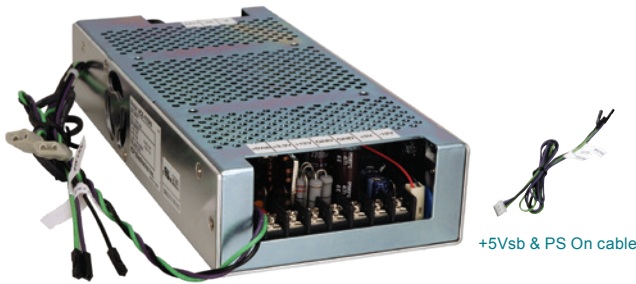
+5Vsb & PS On cable